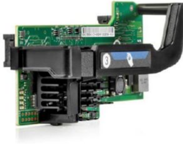
HPE Ethernet 10Gb 2-port 560FLB Adapter

It provides full duplex high performance Ethernet connectivity. The HPE 560FLB FlexibleLOM network adapter helps to extend the benefits of virtualization beyond the server and into the rest of the infrastructure. The HPE 560FLB supports enterprise class features such as VLAN tagging, adaptive interrupt coalescing, MSI-X, NIC teaming (bonding), Wake-on-LAN, Receive Side Scaling (RSS), jumbo frames, EEE 1588, PXE boot and virtualization features such as VMware NetQueue, Microsoft VMQ and Intel's VMDq.